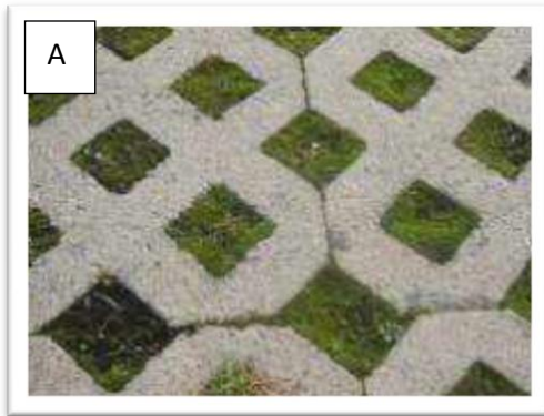
Concrete Grid Pavers