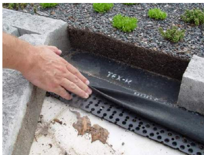
Figure 5.1. Photos of Vegetated Roof Cross-Sections